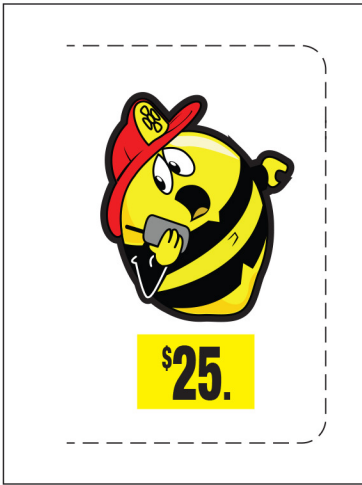
Sample Instant Winners