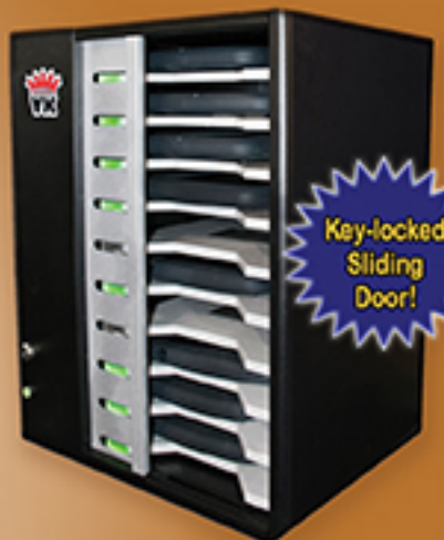
CHARGE-e Wireless Charge Rack

Capable of holding 10 tablets per rack, its power supply and mechanical workings are all serviceable from the front, greatly impacting maintenance ease. To charge simply place the tablets horizontally on the shelves, like you would a pan in the oven. Once on the shelf, there is no possibility for misalignment, since there are no connectors. Just be sure to let them out, 'cause these puppies want to play!